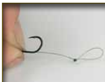
2. Tie a small loop in the end of the line (for your pellet stop) and thread on the hook.