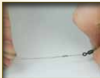
5. Tie the size 8 swivel to the other end of the hook-length leaving a 10cm tag.