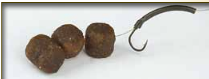
11. Use 2 or 3 pellets on the hair, held on using the pellet stop. Leave about 5mm between the bend of the hook and the first pellet.