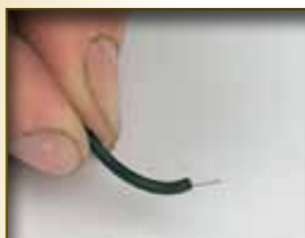
1. Firstly thread the rig sleeve onto the 100cm hook-length of 10lb line.