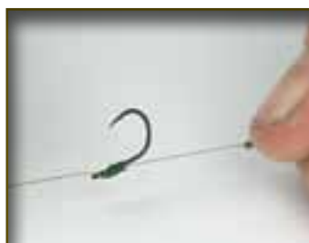
3. Tie on the hook using an eight turn knotless knot. Adjust the length of the hair to suit the bait.