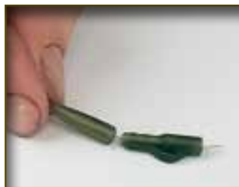
7. Thread the tail rubber and lead clip onto the main reel line.