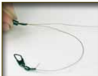
6. Tie the link swivel to the tag end of the hook-length line. This will take the PVA bag.