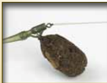
9. Attach the lead to the lead clip and adjust the tail rubber tension so it will eject if snagged.