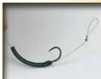
4. Pull the rig sleeve onto the hook to create the classic swept-shank shape.