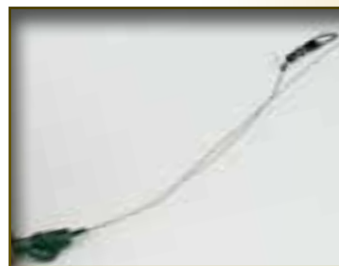
8. Tie the hook-length swivel to the end of the main line and fit the lead clip.