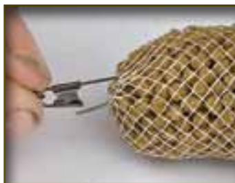
10. The link swivel allows you to easily add a PVA stick or bag to the rig just before you cast out.