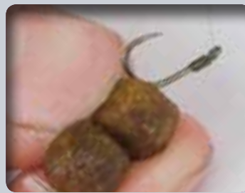
12 The baits should sit just beyond the bend of the hook for maximum effectiveness.

The finished rig can be used on stillwaters, where it acts like a paternoster set-up or on rivers where it acts like a free-running rig but with a semi bolt effect due to the small size 10 swivel.