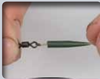
7 Tie the other size 10 swivel to the end of the feeder link, again using a 5 turn grinner knot.