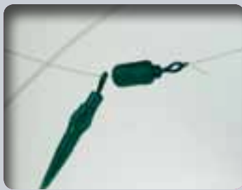
10 Tie the main line to the hook-length swivel and pull the buffer bead onto the hook-length swivel.