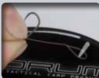
2 Adjust the length of the hair to suit your bait size. Bigger baits generally need longer hairs.