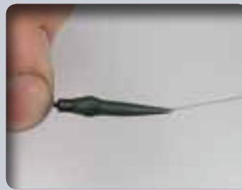
8 Pull the mini anti-tangle sleeve on to the swivel to cover it and act as a mini boom.