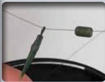
9 Thread the feeder link first and then the buffer bead on to your main line.