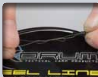
4 Tie a size 10 swivel to the other end of the hook-length, start with a hook-length of 60cm.