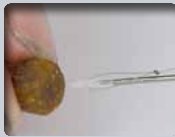
11 Thread one or two Sonubaits or S-pellets onto the hair. Other hook baits can also be used.