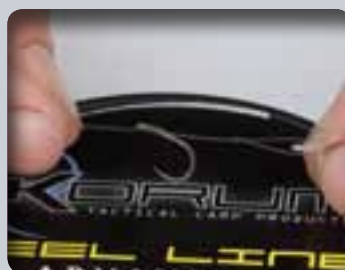
3 Tie on your hook using a knotless knot. This is one of the best knots to use for eyed hooks.