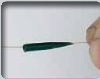
6 Slide the mini anti-tangle sleeve on to the other end of the feeder link - thin end first.