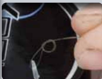
1 Tie on a Korum Quickstop to your hook-length, before tying your hook on, using a small overhand loop.